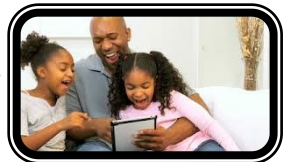
"Single Father" Family

the family unit in modern societies, how do we cope with the issues that present themselves? How do we include everyone, without offending anyone? How do we uphold the "nuclear" family without offending the "blended" family? How do we serve the needs of the various types of families without being labeled "hatemongers?"