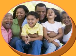
Changing Family Dynamics