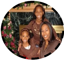
"Single Mother" Family

These are questions that societies struggle to deal with on a daily basis, both inside and outside of the church. We do not have all the answers. We do know, however, that these units, be it "nuclear," "blended," "single," or "gay"